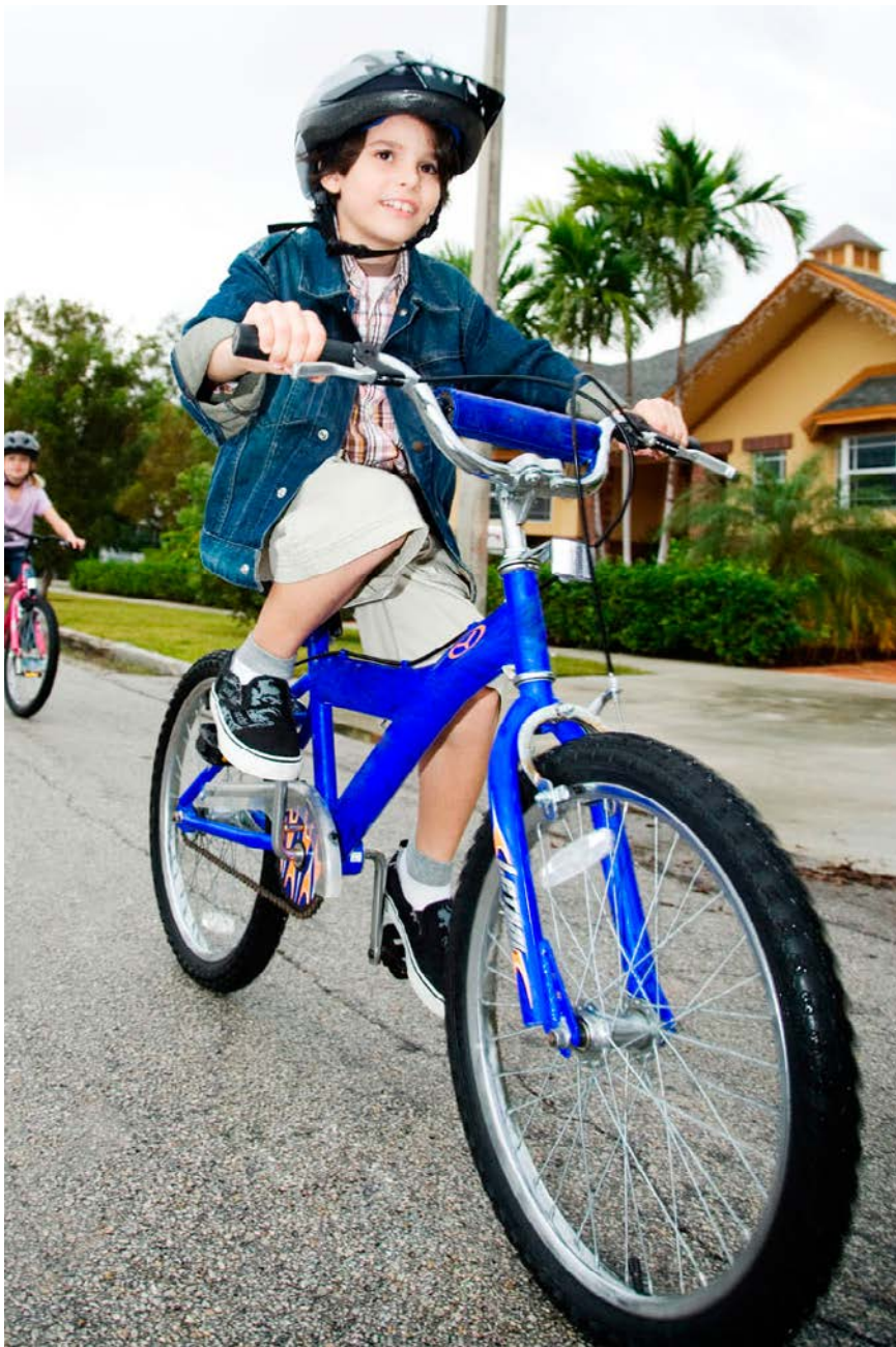
The blue bike.