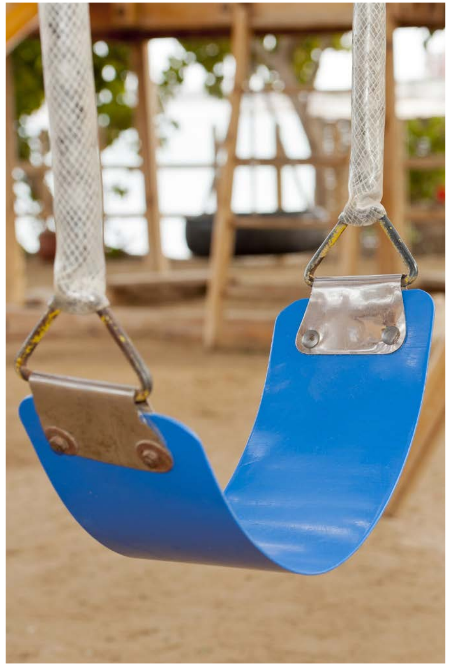
The blue swing.