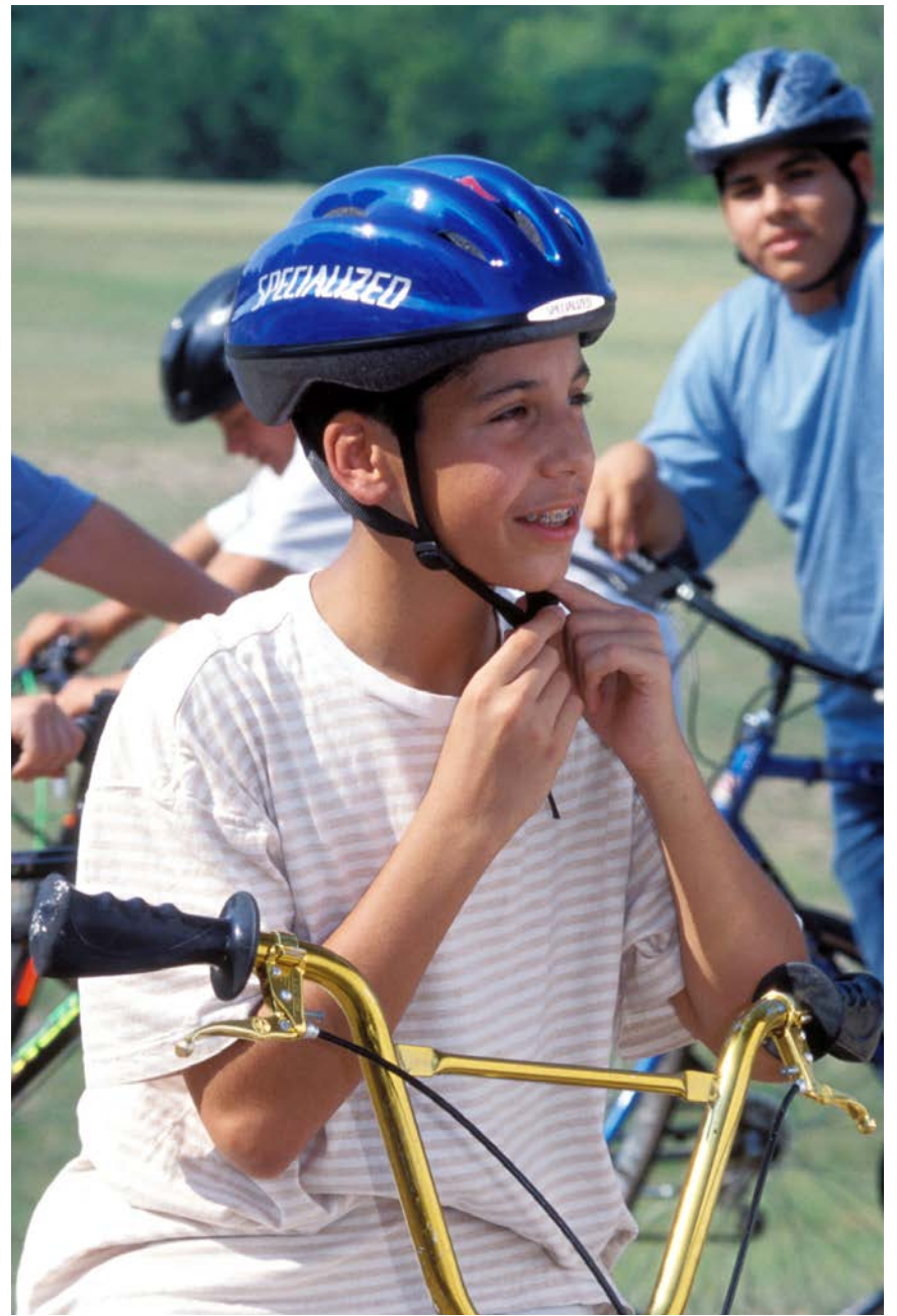
The blue helmet.