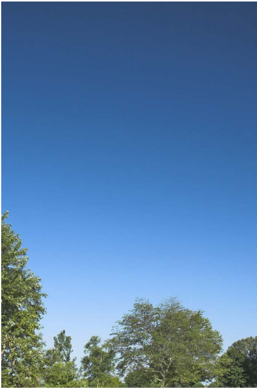
The blue sky.