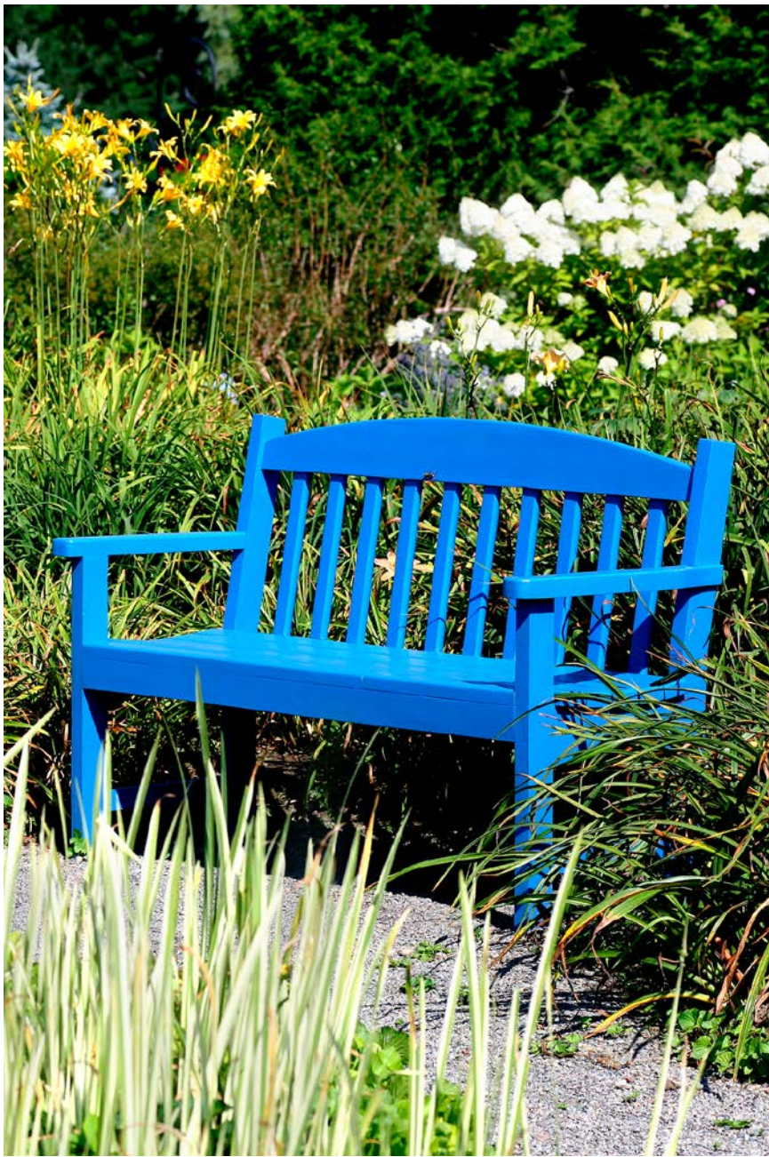
The blue bench.