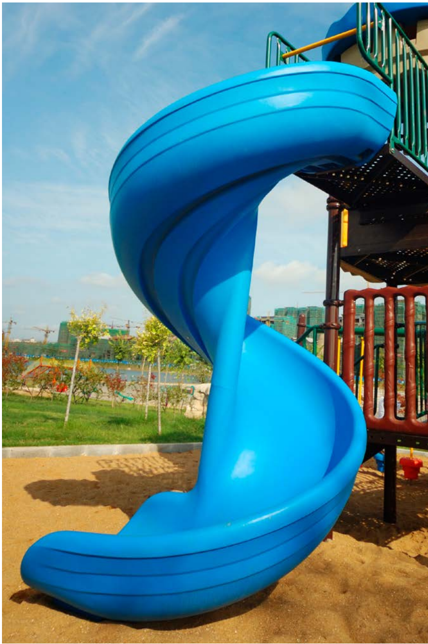
The blue slide.