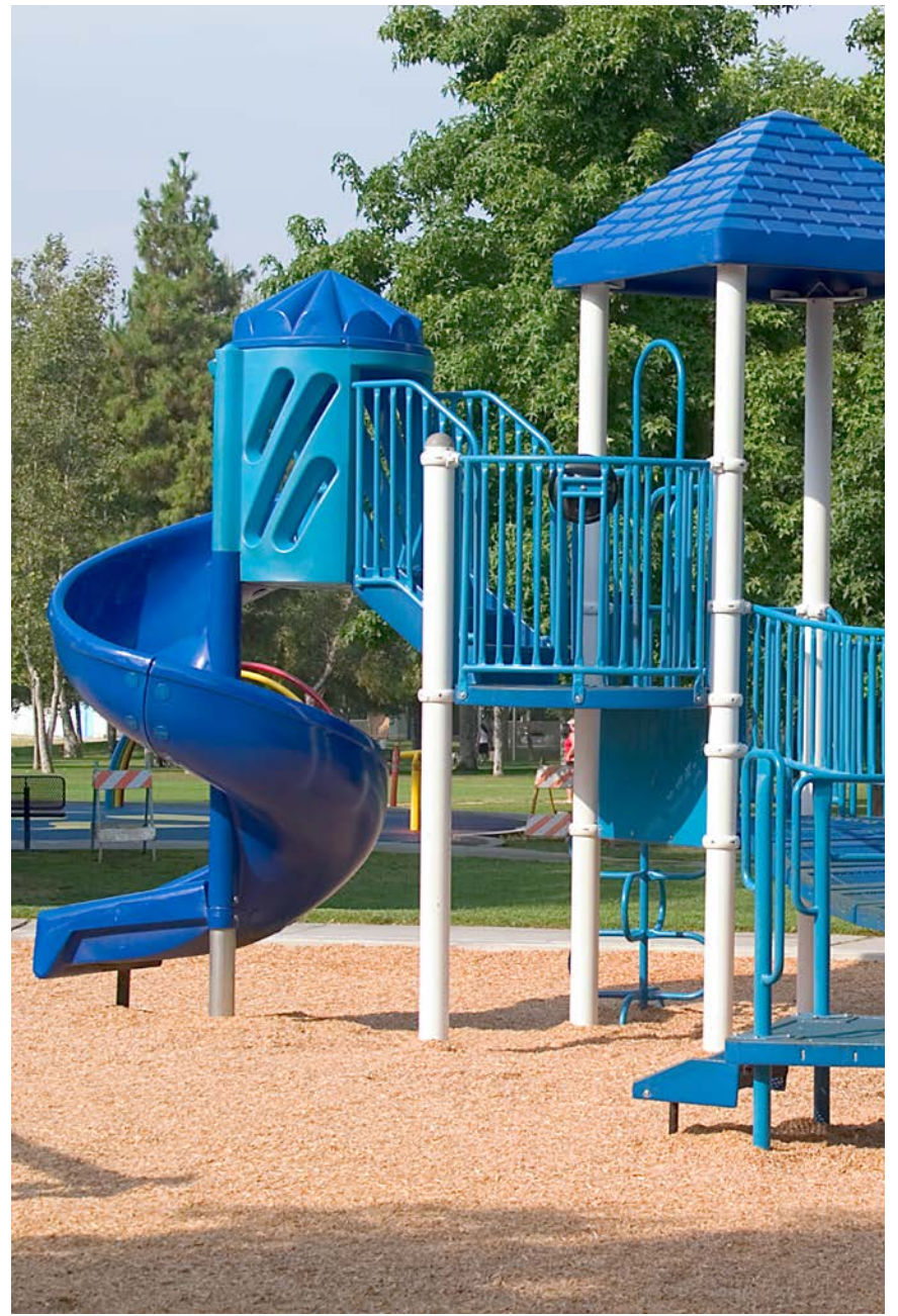
The blue playground.