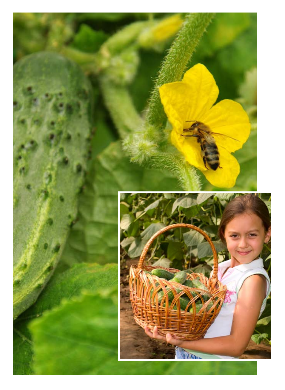
Without bees, we would not have cucumbers.