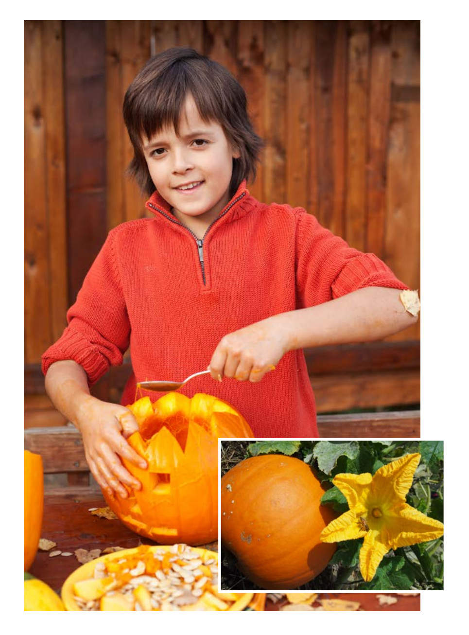
Without bees, we would not have pumpkins.