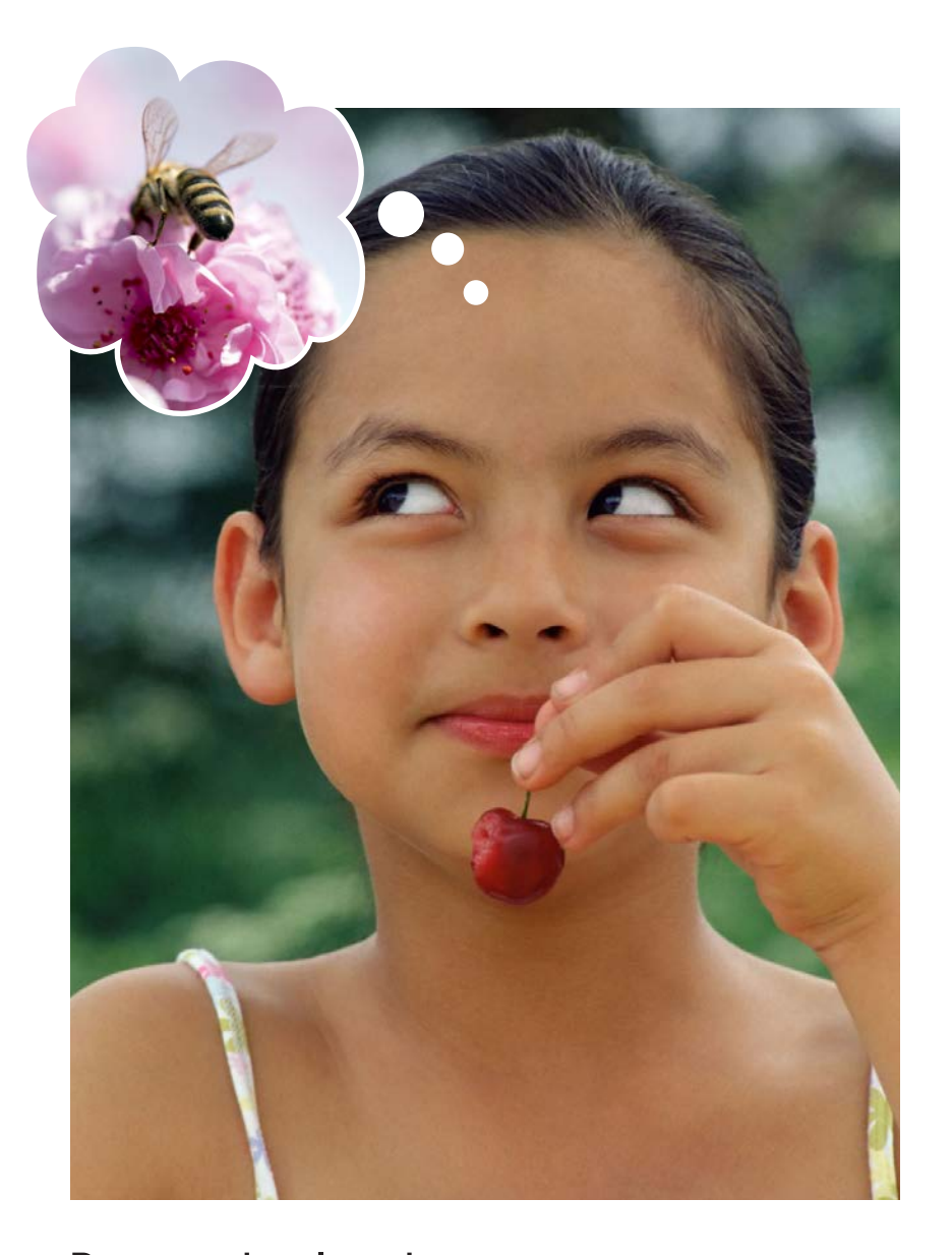
Bees help bring us some of our favorite foods. Thank you, bees!