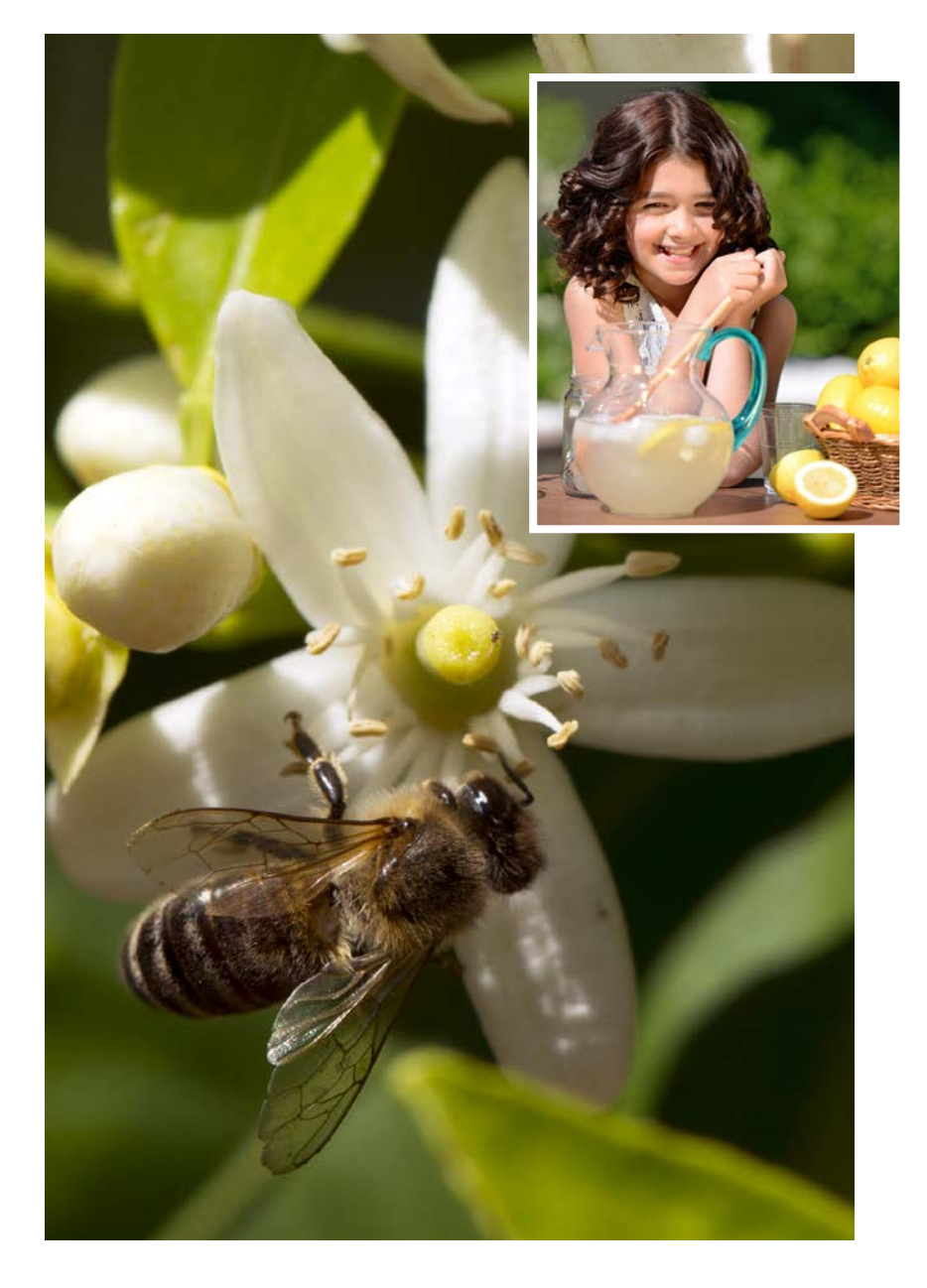
Without bees, we would not have lemons.