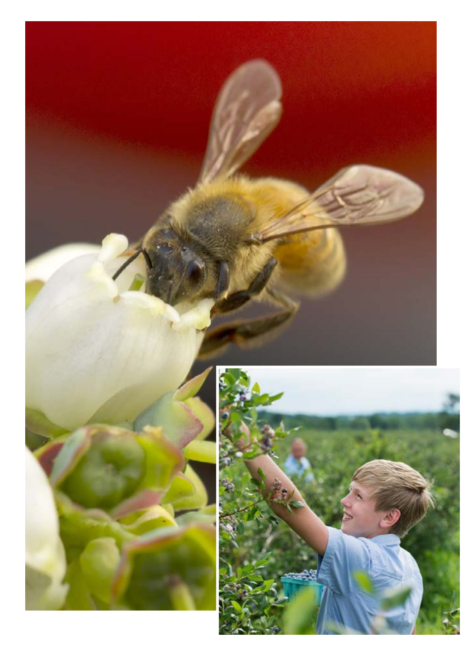
Without bees, we would not have blueberries.