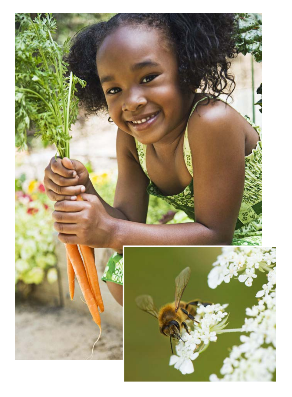
Without bees, we would not have carrots.