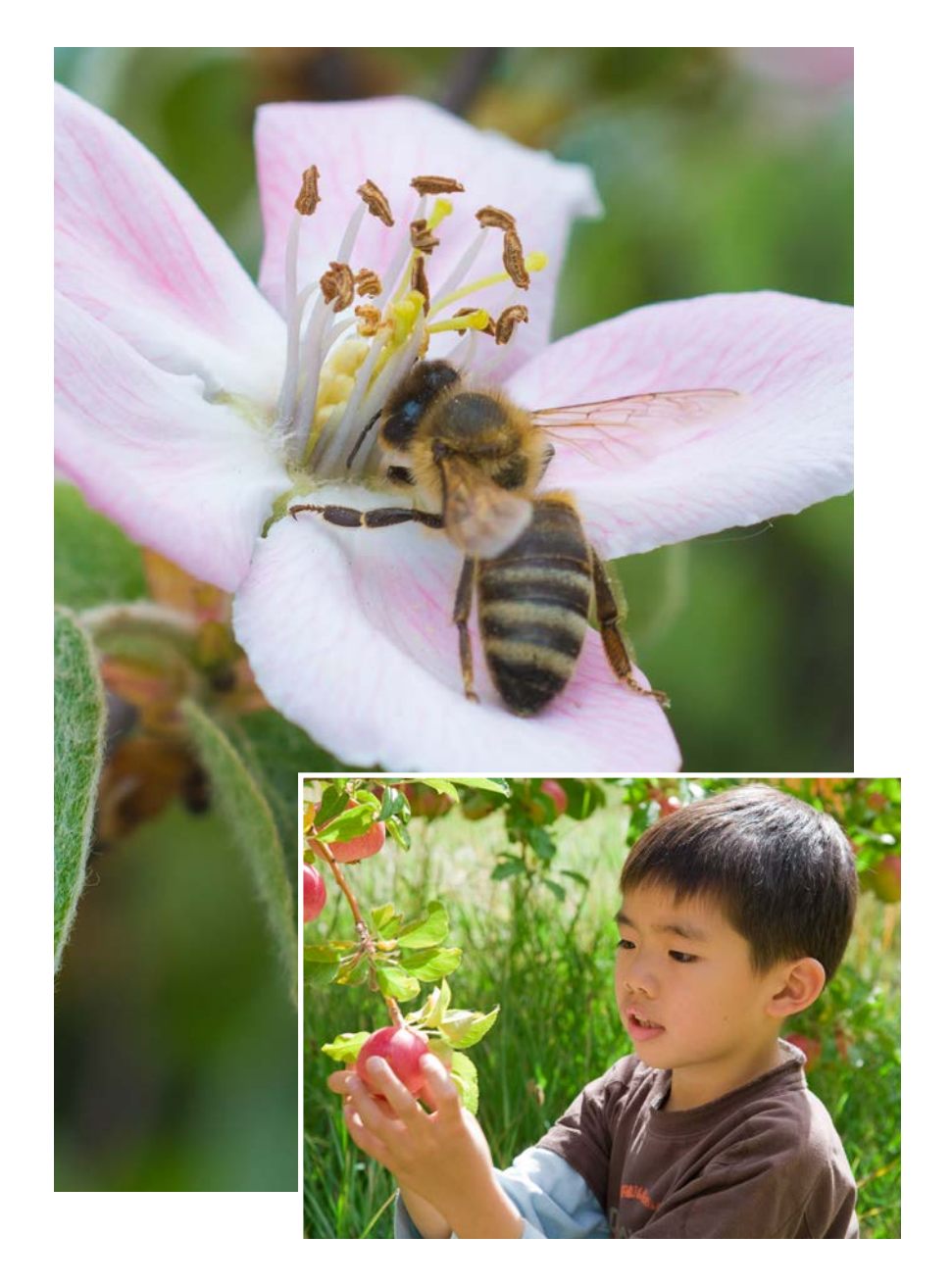
Without bees, we would not have apples.